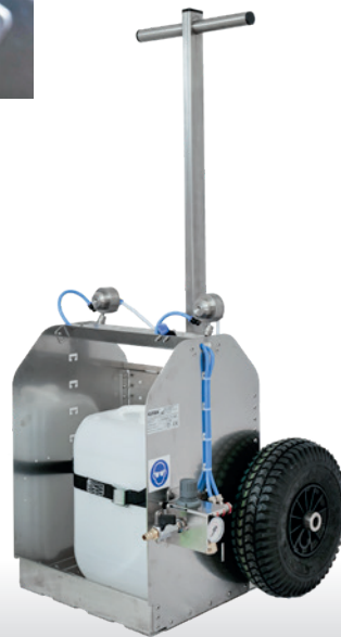
Version with transport trolley