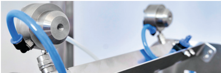
2 spray nozzles