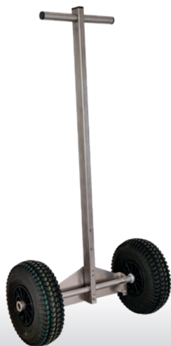
Optional transport trolley