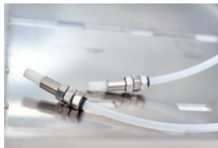
2 suction filters