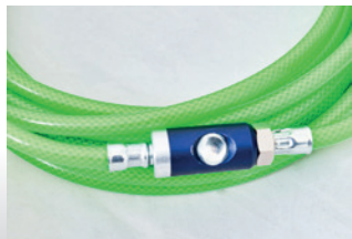
10 m compressed air hose